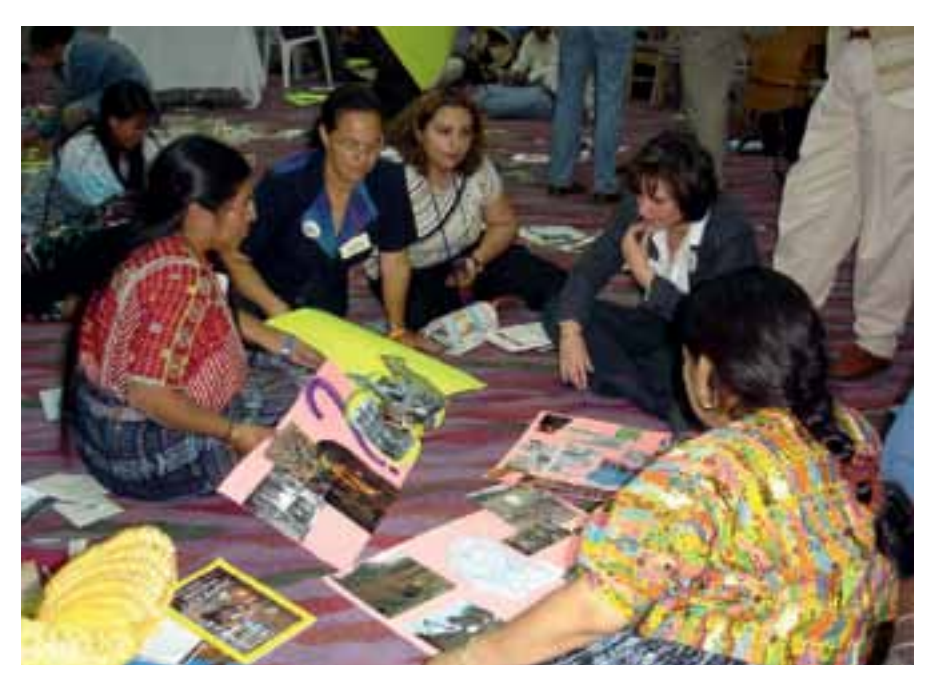
Mayan teachers, community leaders and the Minister of Education engaged in a dialogue to develop a new education policy.

A number of mechanisms have long been used to foster public dialogue and debate. For communication for development purposes such debate must centre on issues which are important to communities. Deliberate efforts must be made to find appropriate forums which place those most affected by an issue at the heart of the debate. The following case studies illustrate how UNDP supports various interactive processes that move beyond canvassing opinion and expand the space for public involvement in making and shaping interventions in policy and practice.