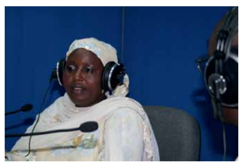
Representative Haja Fata Siryon, of Bomi County, Liberia, responding to questions from her constituents on UNMIL Radio.

UNDP recognises the need to support initiatives that ensure the concerns and priorities of people at the margins of political and social power structures are heard and taken into account by policy makers. The media, particularly radio, has a key role to play in this process as in many countries it is the medium that poor people can access most easily, 'The media is an educator and a key information source that can help deliver the Millennium Development Goals, promote transparent governance and through balanced reporting, help prevent conflicts. The wide benefits from a plural media mean it acts as a public good in development.' The following case studies illustrate how UNDP supports the media to deliver a range of development and governance programmes on issues of public interest.