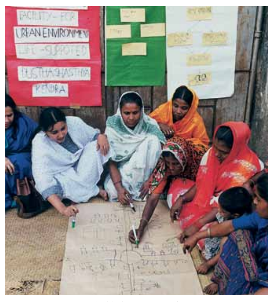
Enhancing women's participation in local development processes - Photo: UNDP/LIFE

experienced through powerlessness and lack of voice. Communication for Development should therefore be regarded as fundamental for all development interventions including HIV/AIDS, the environment (see the Aarhus Convention on Environmental Information)<sup>11</sup>, crisis prevention and recovery and gender.