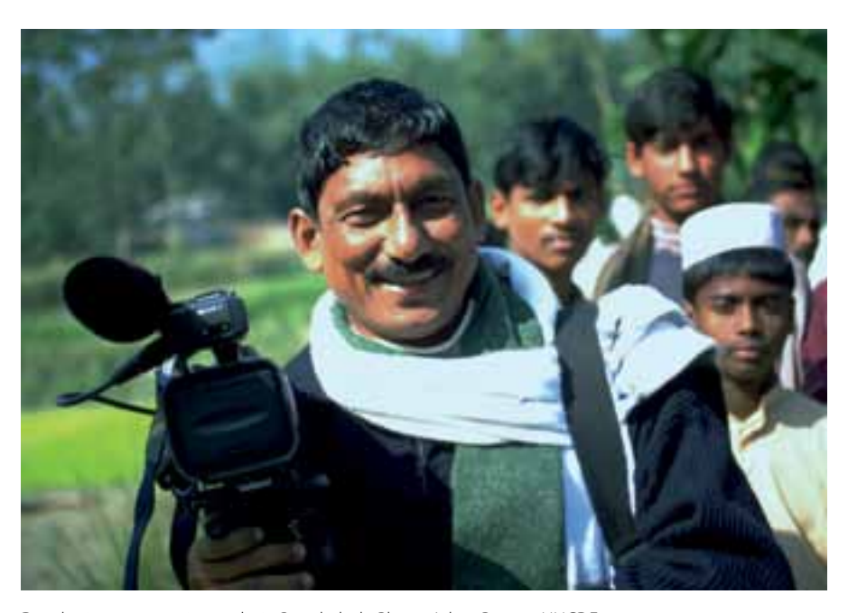
Developing community media in Bangladesh.

In order to participate in dialogue processes people need to be aware of issues and rights, have information about those issues and they need to have the capacity to express views and act on them. Awareness raising mechanisms operate at both individual and collective levels. Some focus on providing relevant information to, and raising the consciousness of, individuals while others aim to mobilize and support more collective efforts to voice concerns and make demands on the system. Awareness raising can be regarded as a 'catalytic force' that ultimately can lead to changes in policy and behaviour of citizens and their government. The following case studies illustrate how raising awareness at both the individual and collective levels is an integral part of UNDP's broader development work.